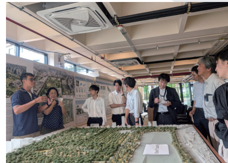
Mission to Bangkok: Observing Urban Greening Initiatives

OECC has established a program committee for its members, through which we promote the formation of networks for information, human resources, and organizational collaboration; to foster human resource development, and provide updates on the latest domestic and international trends.